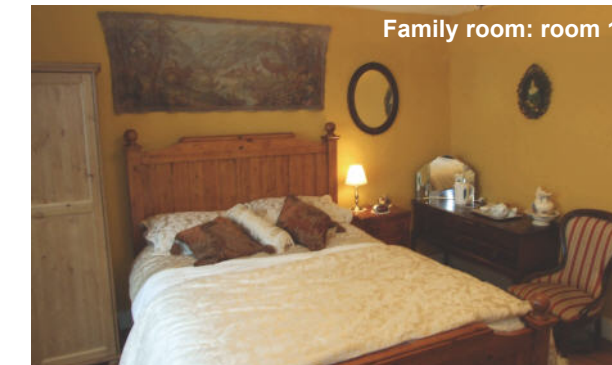
Family room: room 1

We have three delightful bedrooms, two double and one family. Recently refurbished the rooms provide comfortable accommodation, en-suite shower rooms, LCD TVs with Freeview and tea & coffee making facilities. Prices start from £60 per room, (£40 single occupancy), inc full English Breakfast.