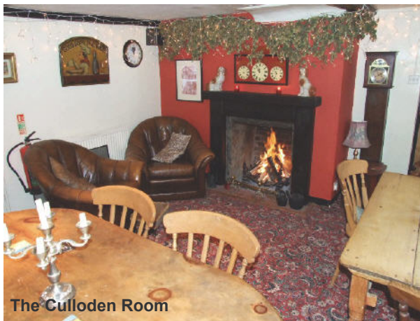
The Culloden Room