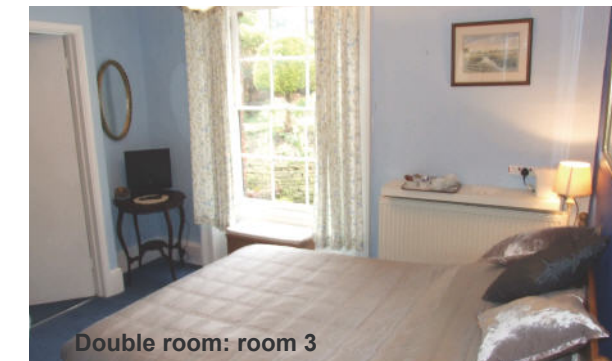
Double room: room 3