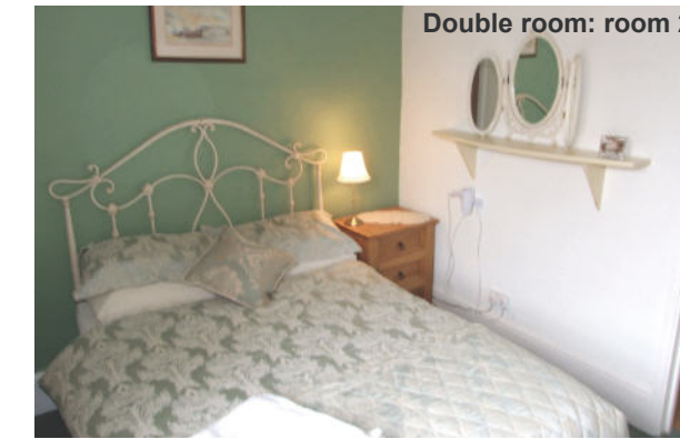
Double room: room 2