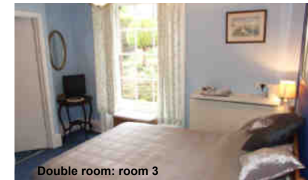
Double room: room 3