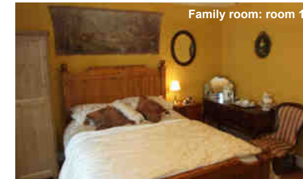
Family room: room 1

We have three delightful bedrooms, two double and one family. Recently refurbished the rooms provide comfortable accommodation, en-suite shower rooms, LCD TVs with Freeview and tea & coffee making facilities. Prices start from £55 per room, (£40 single occupancy), inc full English Breakfast.