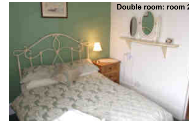
Double room: room 2