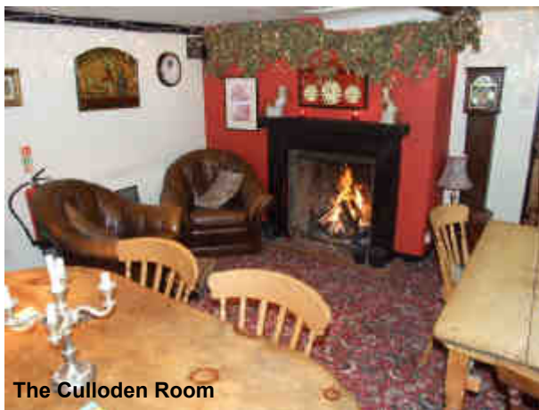
The Culloden Room